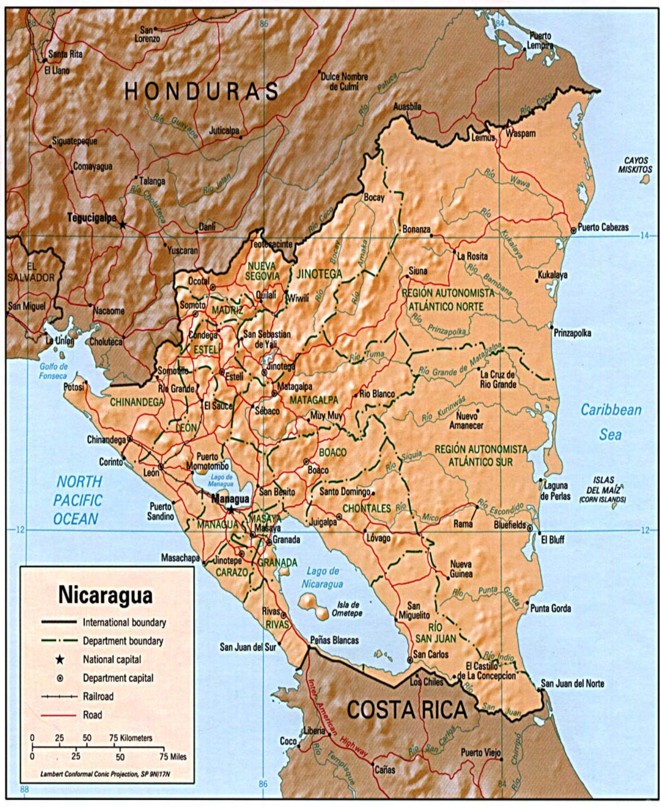
Figure 1. Country Map