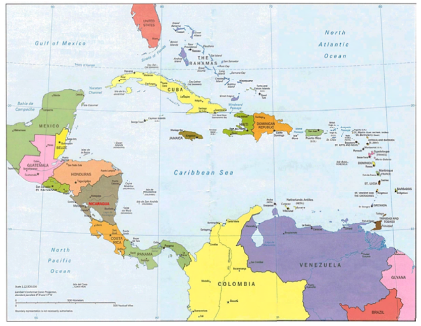
Figure 2. Vicinity Map

The physical geography of the country is divided into three major zones: the Pacific lowlands, the central highlands, and the Caribbean lowlands. The Pacific lowlands extend about 75 kilometers inland from the Pacific coast. Most of the area is flat, except for a line of young volcanoes between the Golfo de Fonseca and Lago de Nicaragua. These peaks lie just west of a highly conspicuous feature in the landscape, which is a long low-lying