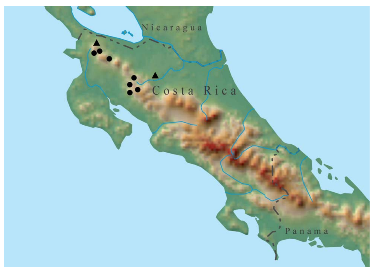
Figure 3. Map depicting the known range and localities of Nubosoplatus inbio (circles), and Corynellus lampyrimorphus (triangles).