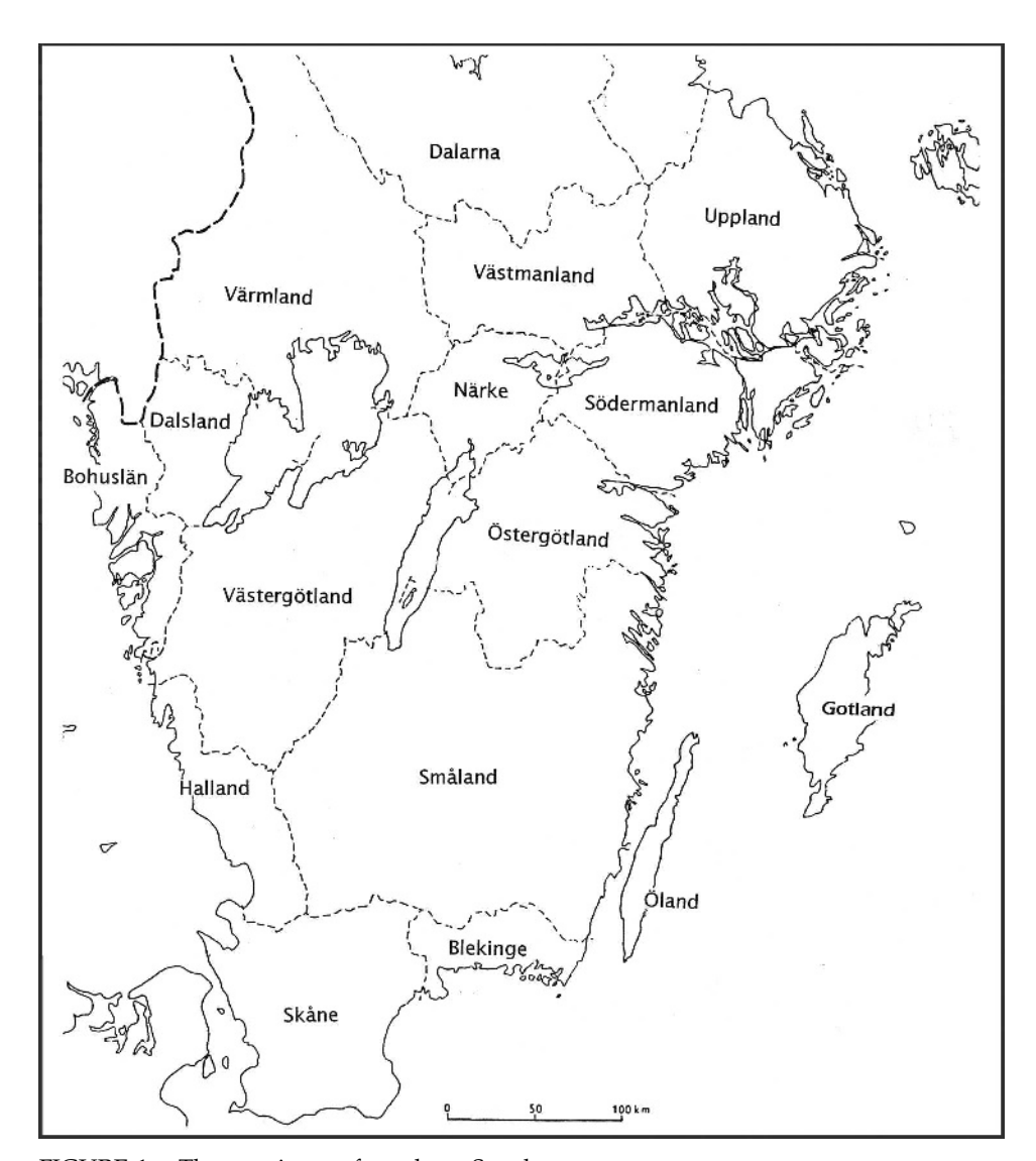
FIGURE 1.—The provinces of southern Sweden.

Östergötland (n=5), Bohuslän (n=2), Dalsland (n=1), Södermanland (n=2), Närke (n=1) and Värmland (n=2). One letter referred to a local poet, John Liedholm, whom in the poem "Smôrjebulken" from 1951, described the old use of black slugs as grease in southern Västergötland (Liedholm 1976:81–82). The distribution of the custom was obviously restricted to the southern part of the country.