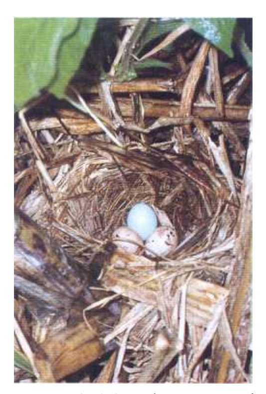
FIG. 1. Nest of Tachyphonus rufus containing 2 eggs of the tanager and 1 egg of the Bronzed Cowbird.

Buff-fronted Saltator Saltator maximus. On 18 May 1986, R. G. Campos collected a clutch of the Buff-fronted Saltator (set not located, probably lost because of recent collection move) that contained one broken host egg and one Bronzed Cowbird egg. Bronzed Cowbirds are known to destroy cowbird and host eggs (e.g., Rowley 1984, Carter 1986), but we are not sure whether the broken egg had been pecked or whether it broke during handling. Campos observed the nest being built on 10 May 1986 at a coffee plantation, elev. 900 m, 2 km W Grecia, prov. Alajuela. This is the first record of the Buff-fronted Saltator as a host of the Bronzed Cowbird.