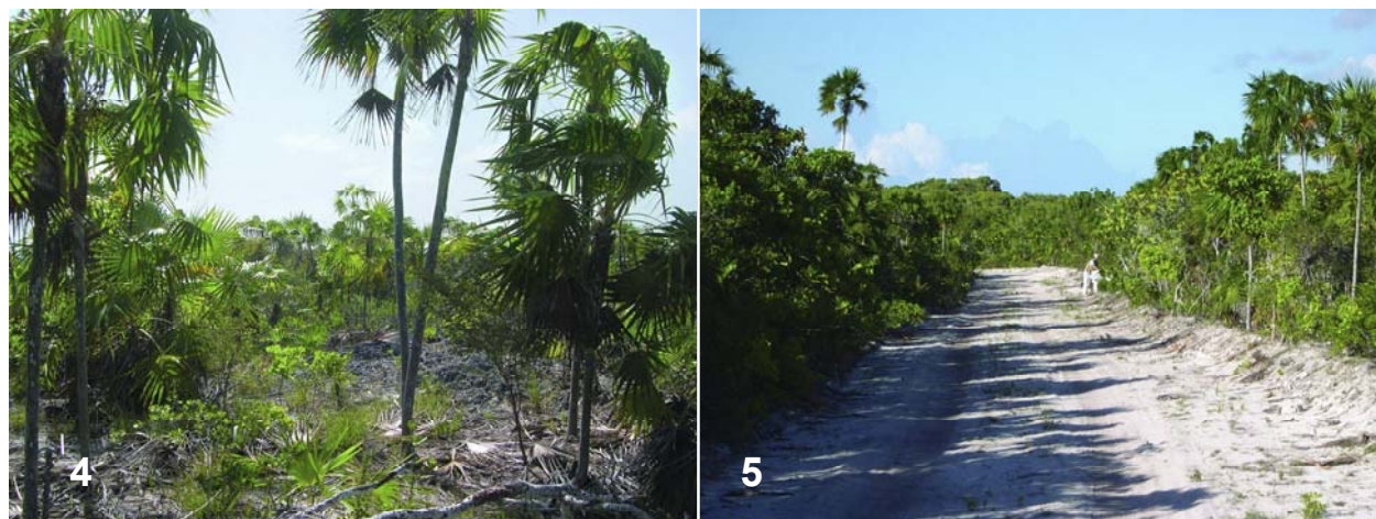
Figure 4-5. 4) Rocky outcrop in Coccothrinax inaguensis forest along south coast of Great Inagua. Photo by M. C. Thomas. 5) Roadside in Coccothrinax inaguensis forest along northwest coast of Great Inagua. Photo by M. C. Thomas.

The male parameres in caudal view resemble those of C. cubana (Chapin), but that species is almost twice the size of C. dolichotarsa , has a shorter antennal club, stout meso- and metatarsomeres, an epipleural flange on the elytral margin of the female, and short, blunt parameres in lateral view.