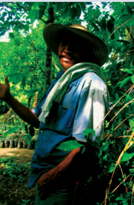
FIGURE 3 A farmer in Colombia's Quindío region with the seedlings he is about to plant on his farm.

ly to be site-specific. As with biodiversity benefits, these benefits will generally not be included in land users' decision-making.