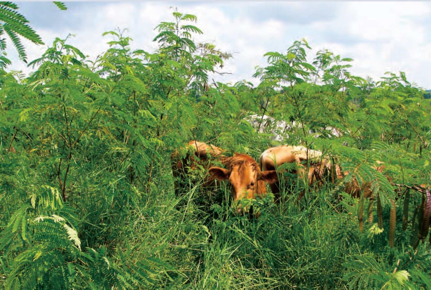
FIGURE 5 Silvopastoral practices introduce a variety of tree species in pasture. Here, cattle graze in an intensive leucaena or leadtree ( Leucaena leucocephala ) system in Quindío, Colombia. Such systems can be more productive and can harbor much higher levels of biodiversity than the extensive pastures they replace. However, high initial costs often make them financially unattractive to land users.

diversity than current monocultural, treeless pastures. Figure 6 shows initial data from biodiversity monitoring at the Costa Rica and Nicaragua sites. These results show that land used under a silvopastoral system harbors higher levels of biodiversity than treeless pastures. The observed diversity of bird species, as well as the number of individuals (not shown in Figure 6), is greater on land with trees, and higher yet when the tree density is higher. Similar results are being obtained for other indicators (vegetation, ants, and butterflies).