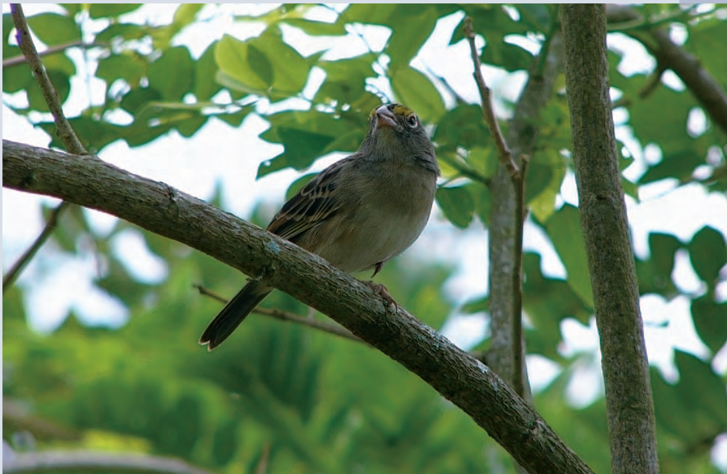
FIGURE 2 Coal miners have their canary, and the Silvopastoral Project has the sabanero grillo ( Ammodramus savannarum ). This critically endangered species was observed in a live fence planted under the Project in Quindío, Colombia.