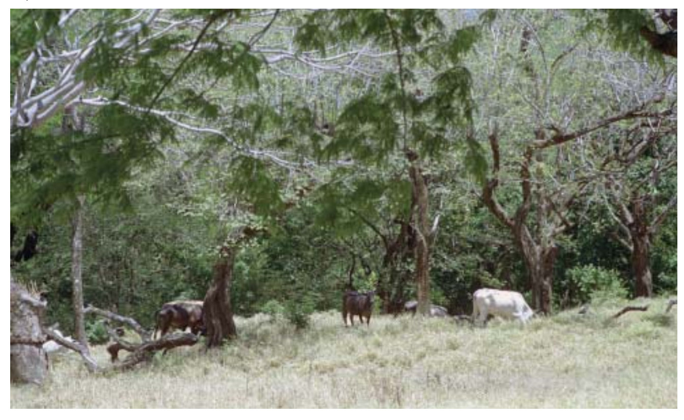
Photo 1 — Silvopastoral systems, in which pastures include significant tree cover, tend to be more productive and to provide a much better habitat for biodiversity. Here, cattle graze in pastures with high tree cover in Esparza, Costa Rica.