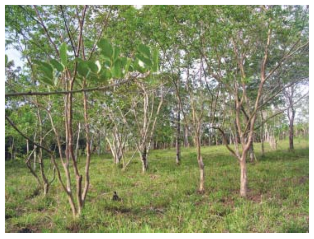
Photo 3 — Improved pastures with high tree cover in Matiguás, Nicaragua

Photo 2 — Degraded pasture in Matiguás, Nicaragua