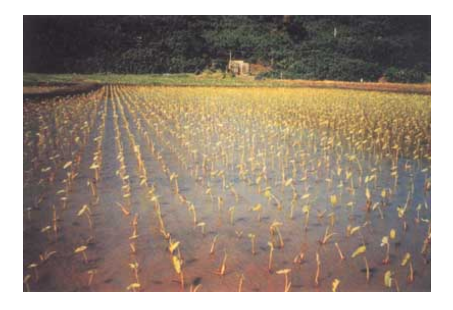
Figure 2. Flooded Cultivation of Taro

Flooded taro cultivation (Figure 2) occurs in situations where water is abundant. The water may be supplied by irrigation, by the swampy nature of terrain, or from diverted rivers and streams. The soil must be heavy enough to permit the impounding of water without much loss through percolation. Apart from rice and lotus, taro is one of the few crops in the world that can be grown under flooded conditions. The large air spaces in the petiole permit the submerged parts to maintain gaseous exchange with the atmosphere. Also, it is important that the water in which the taro is growing is cool and continuously flowing, so that it can have a maximum of dissolved oxygen. Warm stagnant water results in a low oxygen content, and causes basal rotting of the taro.