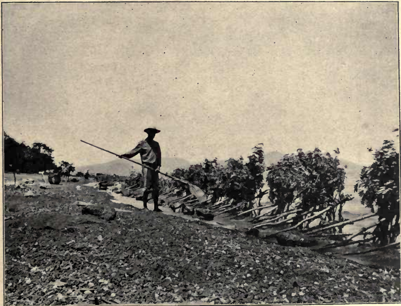
FISHING FOR SARDINAS.

March, evidently depositing its eggs, when possible, in shady places in shallow water. The natives capture these by placing small bushes along the shore about three feet apart in shallow water. These fishes come in large numbers into the shade of these bushes to deposit their eggs. The natives draw their hand nets around the bases of these bushes, catching from a few to a quart of these fishes at each dip. The fishes are thrown into holes scooped in the sand. They are then spread on the sand and left there until dry, after which they are ready for market. They are also eaten fresh as "white bait," and are very palatable.