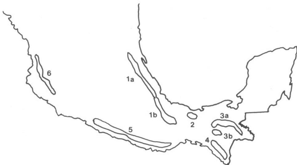
Figure 2. Map showing location of submontane islands in Mexico. 1a = Sierra Madre Oriental. 1b = Sierra de Juárez. 2 = Los Tuxtlas, Veracruz. 3a = Vertiente Atlántica de Chiapas. 3b = Chiapas, centro. 4 = Chiapas, Vertiente Pacífica (Soconusco). 5 = Oaxaca-Guerrero. 6 = Nueva Galicia.

areas of southern Mexico (Chiapas, Oaxaca, and Guerrero) contain the highest numbers of endemics, including those of high taxonomic rank. Furthermore, those areas are located in the geologically more suitable and older sierras of Mexico: Macizo Central de Chiapas, Sierra Madre del Sur, and Sierra de Juárez.