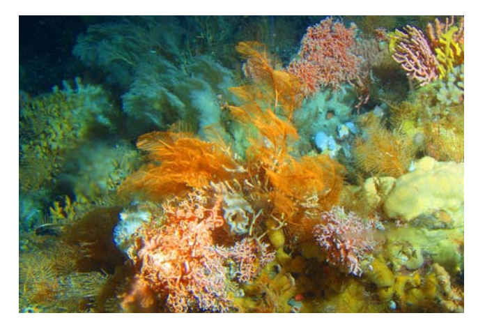
Figure 3. Diverse benthic habitat off Adak Island, Alaska, showing sponges, hydroids, and stylasterid corals of the genus Stylaster at a depth of 150 meters. Stylasterid corals are among the most important habitat-forming invertebrates in deep-sea coral ecosystems in the North Pacific [24]. doi:10.1371/journal.pone.0002429.g003

A worldwide sampling of 100 stylasterid species (classified in 20 of the 26 genera) was obtained during scientific expeditions conducted by the United States National Oceanic and Atmospheric Administration (NOAA) off the Gulf of Alaska (in 2001), the Aleutian Islands (in 2002), and Washington State (in 2003), as well as during the 'Norfolk2' expedition conducted by the L'Institut de recherché pour le développement (IRD), in 2003, off New Caledonia (Table S1). Specimens provided by collabo-