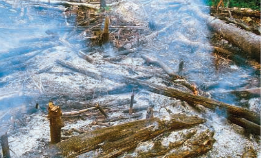
Deforestation. The aftermath of forest burning in central Amazonia.

Some Amazonian forests are directly cleared for soy farms (8). Farmers also purchase large expanses of cattle pasture for soy production, effectively pushing the ranchers farther into the Amazonian frontier or onto lands unsuitable for soy production (9). In addition, higher soy costs tend to raise global beef prices because soy-based livestock feeds become more expensive (10), creating an indirect incentive for forest conversion to pasture. Finally, the powerful Brazilian soy lobby is a key driving force behind initiatives to expand Amazonian highways and transportation net-