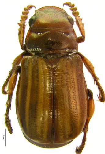
5. Bolax foveolata , male