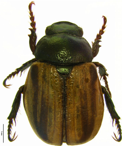
1. Microchilus lineatus , male