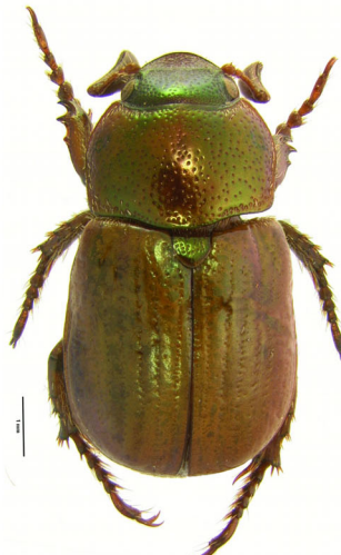
6. Leucothyreus beckeri , male