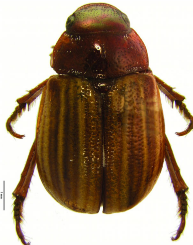
3. Microchilus rodmani , male