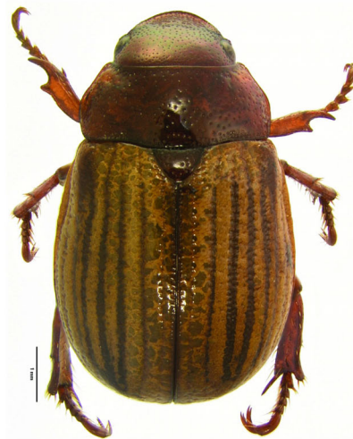
4. Microchilus rodmani , female