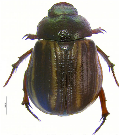
2. Microchilus lineatus , female