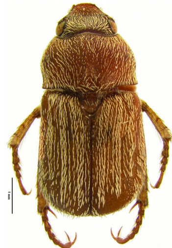
7. Eunanus murinus , male