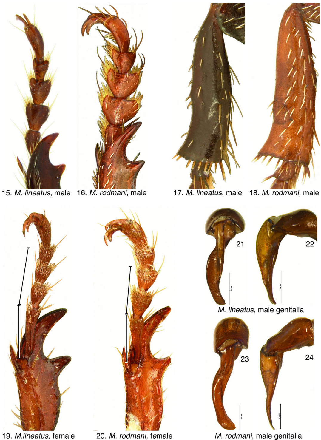
Figure 15-24. Diagnostic characters of Microchilus species. 15) Right protarsomeres of male M. lineatus , dorsal view. 16) Right protarsomeres of male M. rodmani , dorsal view. 17) Right metatibia of M. lineatus , ventral view. 18) Right metatibia of M. rodmani , ventral view. 19) Right protarsomeres of female M. lineatus , ventral view. 20) Right protarsomeres of female M. rodmani , ventral view. 21-22) Parameres of M. lineatus , dorsal view and lateral view, respectively. 23-24) Parameres of M. rodmani , dorsal view and lateral view, respectively. Scale line = 0.5 mm.