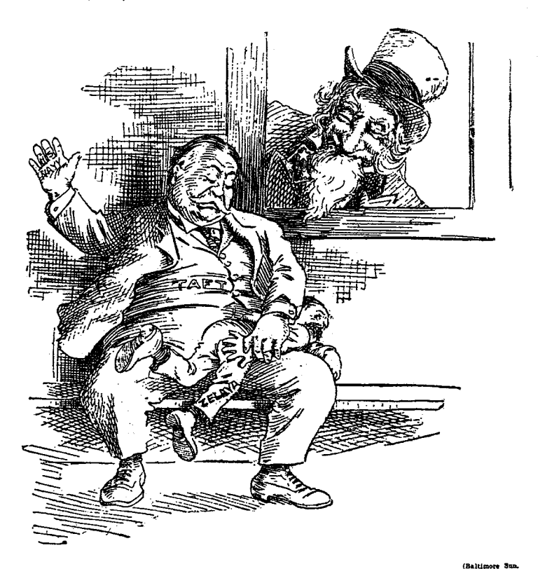
UNCLE SAM: If you are sure he deserves it, Bill, lay it on.

such expectations, Estrada cancelled concessions in December 1909. In a dramatic gesture he also seized the contents of the Emery store in Bluefields, distributing them to local people. According to the terms of the recently-negotiated Emery settlement, these goods were supposed to have been handed over to the Nicaraguan Government. 98