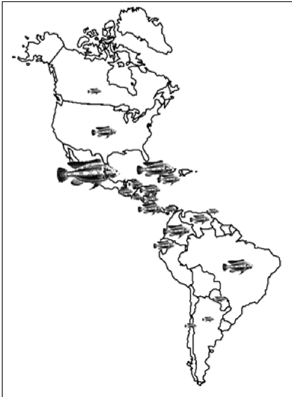
Figure 1. Tilapia production in the Americas. Size of fish symbols indicates relative size of total production.

sport fishing of tilapia. The market is supplied mostly with red tilapia. There is a growing perception of tilapia as a high quality fish. In taste tests of tilapia with native freshwater fish, a group of chefs rated tilapia the highest quality (Chammas 1999). Rapidly increasing population, along with declining yields from capture fisheries is contributing to increasing demand for tilapia products.