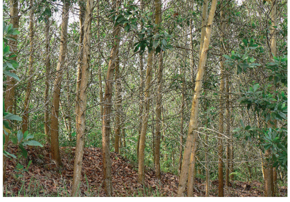
The Planted Forests Project will mingle pockets of acacia trees (above) with existing tropical forest.

Everyone agrees that there are limits to what can be called biodiverse. On the other side of the highway from one of the acacia plantations lies a wasteland of terraced, orangeish soil — the scar of an oil-palm plantation. Malaysia is the