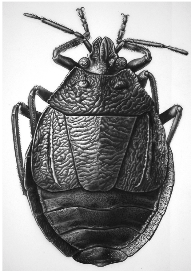
Figure 2. Hondocoris cavei , new genus, new species; dorsal habitus.

Description: Brachypterous; membranes of wings absent, hind wings absent; ocelli absent. Eyes contiguous with pronotum (Fig. 2). Humeral angles weakly and anterior pronotal angles not produced, pronotal margins not explanate. Scutellum short and broad, lateral margins straight, without frenal constriction or discontinuity; apex of scutellum attaining mid-abdomen (5th tergite). Meso- and metasternum thinly carinate on midline. Scent gland orifice round, without spout, but located on caudal side of short raised auricle which extends laterally about one-tenth distance to metasternal margin. Paired trichobothria located on each abdominal sternite behind and about half-way between each spiracle and lateral margin. Antennae five-segmented. Labium arising slightly before anterior limit of eyes; intercalary segment absent; basal segment projecting caudad of bucculae and attaining middle of prosternum. Pro- and mesotibiae prismatic in cross-section; metatibiae sulcate on planar surface. Superior surface of third metatar-