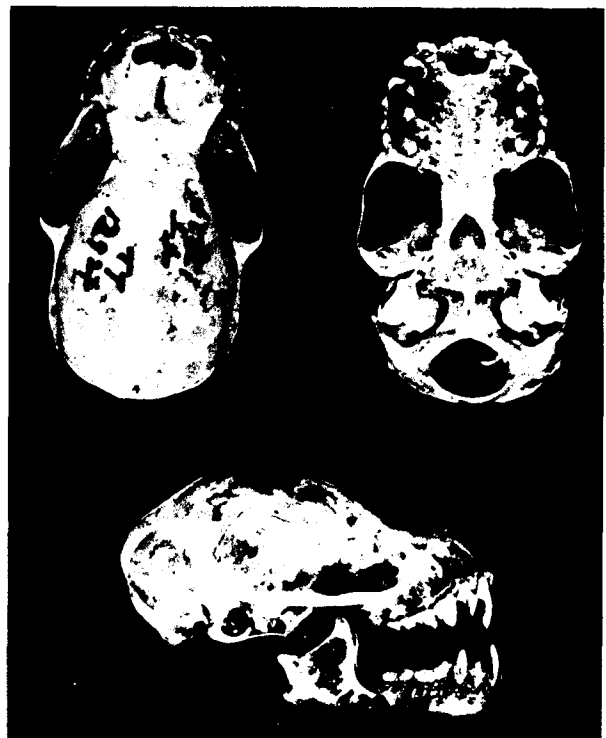
FIGURE 1. Dorsal, ventral, and lateral views of skull and lateral view of lower jaw of Artibeus toltecus toltecus ( \delta , TTU 12927) from Cariblanco, Costa Rica. Greatest length of skull is 20.2 mm.

Forman et al. (1979) found the digestive systems of seven species of Artibeus (including toltecus ) and Centurio to be similar.