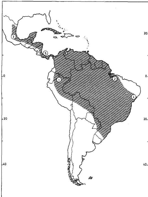
FIG. 2. Distribution of Agouti paca : 1, A. p. guanta ; 2, A. p. mexicanae ; 3, A. p. nelsoni ; 4, A. p. paca ; 5, A. p. virgatus . Boundaries between subspecies are not shown because subspecies are not well defined. Adapted from Mares and Ojeda (1982) and Hall (1981).

GENERAL CHARACTERS. Agouti paca is one of the largest living rodents. Its body is heavy and robust. The upper coat color varies from reddish brown to dark chocolate or smoke-gray and there is a pattern of white or pale-yellowish irregular spots on the flanks (Fig. 1). These spots, most numerous in young, are arranged in a variable number (two to seven, four on the average) of longitudinal rows. One or two upper rows are shorter and limited to the posterior one-half of the body. At least the two middle rows extend from the neck to the rump. The lowest row is visible only in its extreme anterior and posterior parts, its median part is fused with the white ventral surface of the body (Husson, 1978).