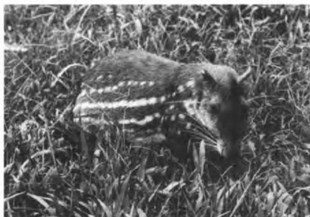
FIG. 1. Adult female paca ( Agouti paca ) in Venezuela.

DIAGNOSIS. Agouti paca resembles A. taczanowskii in most external features. A. paca is distinguished by its relatively larger body size, thinner and harsher fur, shorter nasals, larger orbits, more posteriorly situated postorbital, thicker claws and less granulated soles. The zygomatic region generally is more rugose (Ellerman, 1940).