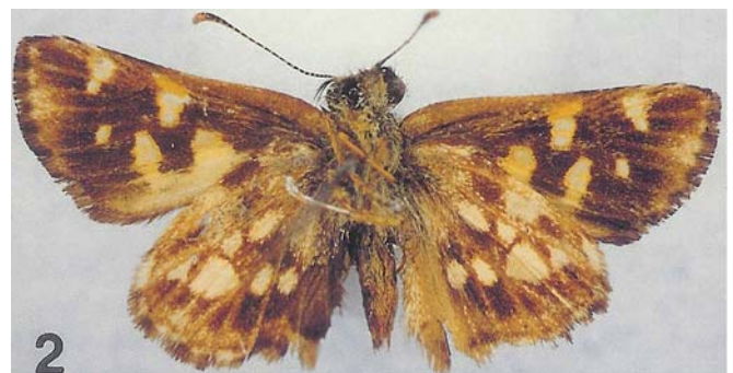
Fig. 1-2. Dalla freemani : 1) male holotype, dorsal surface; 2) ventral surface, from Olas de Moka, Solohi, Guatemala, 3000ft, Sept. [1908], G. P. Englehardt (AMNH) (line = 1.0mm).

Description. - MALE. Forewing length (from base to apex): 12.7mm. Upperside: Ground color dark chocolate brown with very sparse yellowish overscaling on basal half of wing, and along inner margin. Pale ochreous semi-hyaline spots as follows: three small, conjoined apical spots in a straight line in R3-R4 to R5-M1; a fairly rounded discal cell spot, offset basally from end of cell by a distance roughly equal to the width of the spot; a very small circular spot in M3-CuA 1 centered