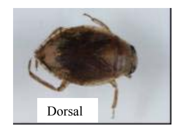
Naucoridae Macrocoris flavicollis ? (Signoret, 1861)

This species is larger than Laccotrephes ater . One specimen was taken from a culvert at Fouditi, and one was collected from a seasonal water body at Igana. Three specimens were found along the bank of the Ouémé, one at Avrankamè and two others at Yokon.