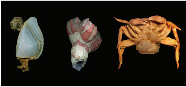
Figure 1 Representatives of Cirripedia. From left to right: a goose barnacle (Thoracica, Lepadidae); an Indo-Pacific giant acorn barnacle (Thoracica, Balanidae); and the externa of a parasitic Sacculina (Rhizocephala) sitting under the abdomen of a crab.

than a hundred years exclusively by its larval stages. With this study, the authors approach the solution of one of the last major riddles of the complex biology of thecostracan crustaceans, which has puzzled numerous zoologists over the past two centuries.