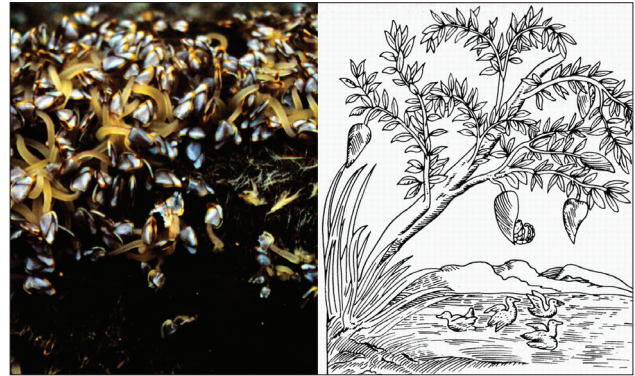
Figure 2 Barnacles as early stages in the life cycle of geese. Left: goose barnacles attached to a drifting log. Right: medieval view of the 'goose tree' producing geese of the genus Branta from barnacles.

Barnacles, and this is true for Cirripedia and their kin in general, are one of those groups whose phylogenetic position has only been resolved by the recognition of their life cycle. The details of cirripede ontogeny were for a long time entirely unknown, although some speculations existed, the most curious of which was that barnacles represented early ontogenetic stages of geese, probably the Brent Goose