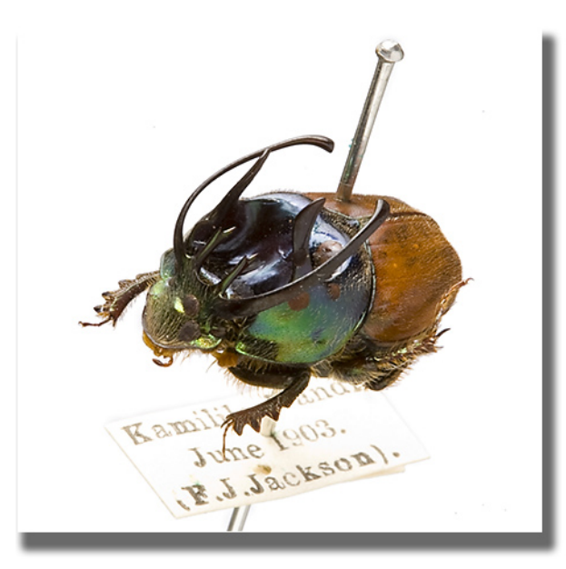
SCARABAEINAE, Onthophagini, Onthophagus ( Proagoderus ) elgoni d'Orbigny, 1915.