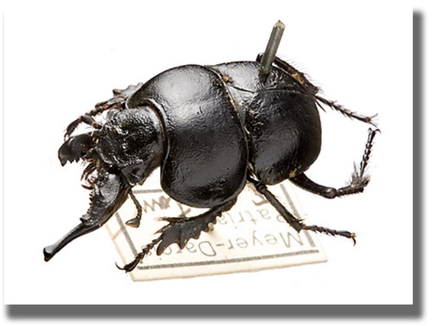
GEOTRUPIDAE, Lethrinae, Lethrus ( Ceratodirus ) gladiator Reitter, 1897.