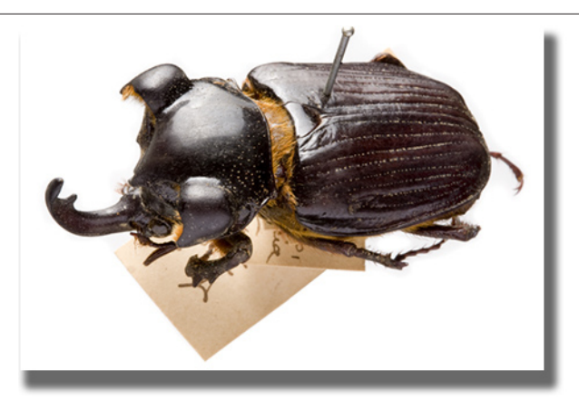
TRICHIINAE, Pantodinus klugi Burmeister, 1847.