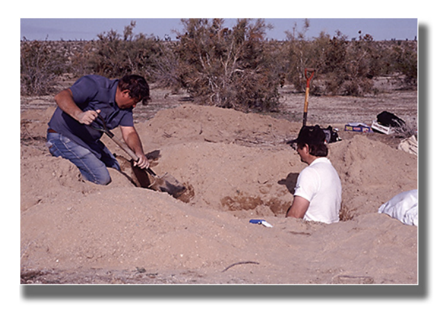
Still only elbow deep, the nest has still not been unearthed.