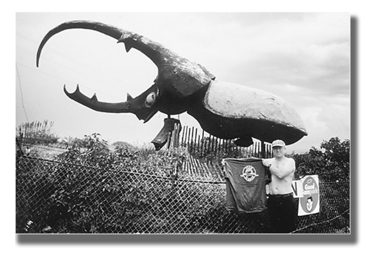
Brett also submitted this photo of one of the major male Dynastes in his collection.