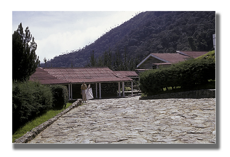
Photo 6: Forestry Station at 7,000 feet on north slope of Sierra Nevada de Santa Marta.

Santa Marta, where we found a motel out of town on the beach near the airport. While there were lots of scrub vegetation nearby (Photo 5), we were told that the week before they had had the first rain in five months! Our black light, run near the motel, produced two scarabs and perhaps ten cerambycids that night. Santa Marta was in the rain shadow of the Sierra Madre de Santa Marta and showed this by having lots of cacti, acacia, etc. By 1 PM it was too hot for us, so we went to town and made arrangements with the forestry people at Inderana