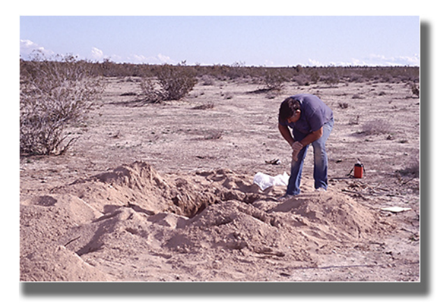
"Rich! I know you are down there somewhere!"