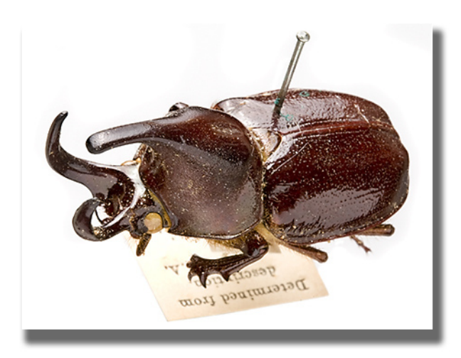
DYNASTINAE, Agaocephalini, Aegopsis curvicornis Burmeister, 1847.