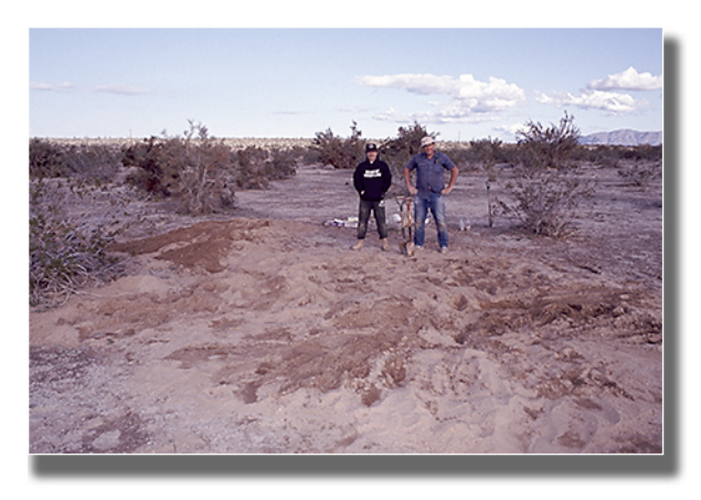
At the end of a long afternoon, the holes and trenches are filled back in, and Dellacasiellus glamisensis has been confirmed as an inquiline in gopher nests.