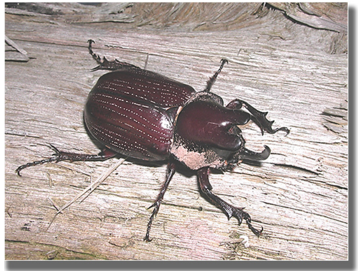
Coelosis biloba.