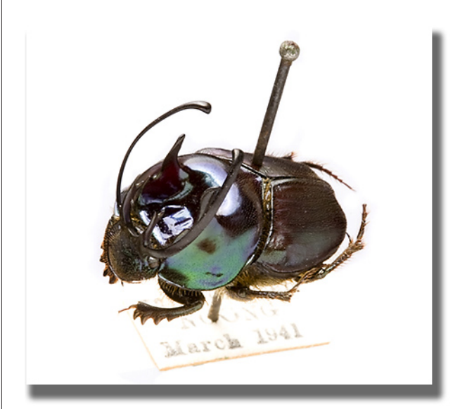
SCARABAEINAE, Onthophagini, Onthophagus (Proagoderus) brucei Reiche, 1847.