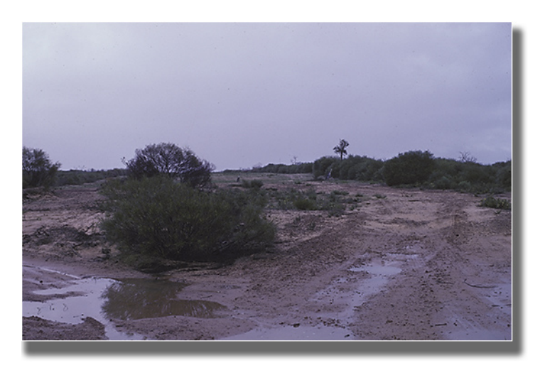
Photo 2: Golf course (?) near Kalbarri, WA; if one looks hard, a golfer is just visible in far back.

active when the surface of the ground is damp or wet, not when the first foot or so of soil is dry. In WA, temperature did not seem as important as moisture, since I had a few specimens come to light when frost had formed on the car windshield. Most geotrupines (Bolboceratini in Australia) had to be dug out; fortunately their burrows were easy to see on open ground. Generally they seemed to be most numerous in sandy areas, which was great until one realized that it was easy for the beetles to