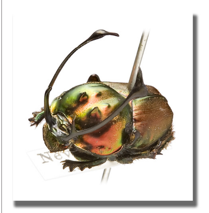
SCARABAEINAE, Onthophagini, Onthophagus (Proagoderus) rangifer Klug, 1855.