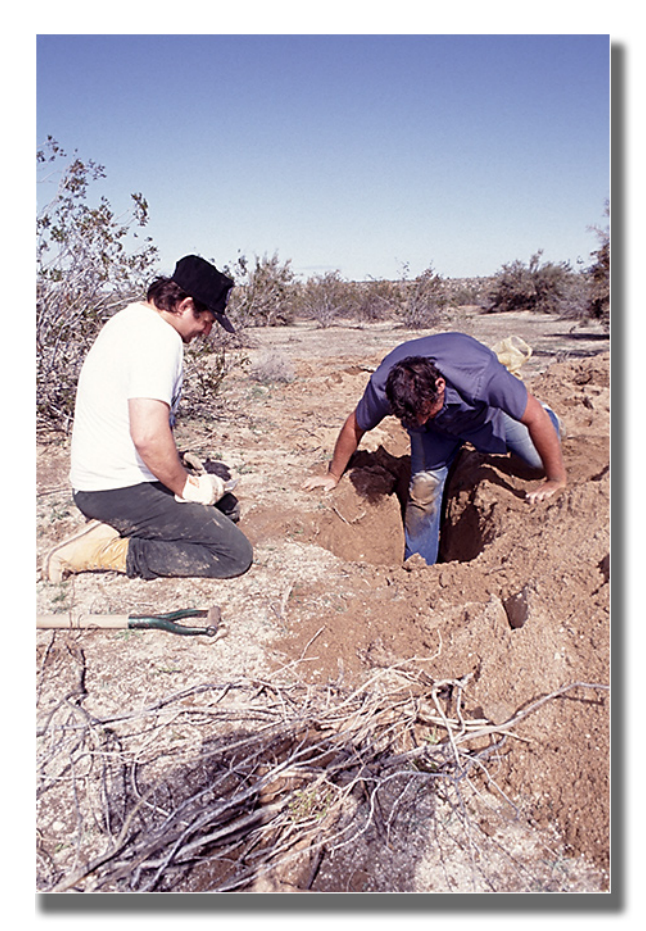
The starting point of our digging trails off the edge of the photo, far into the distance, and we are only knee deep at this point!