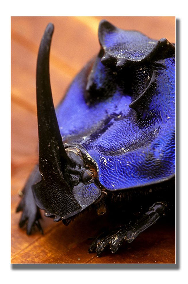
Trond Larsen submitted these two images of Coprophanaeus lancifer , certainly one of the most beautiful horned scarabs.