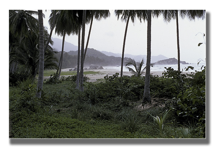
Photo 9: Tayrona Park, north shore, out of the rain shadow that keeps Santa Marta so dry.

about 21 miles northeast of Santa Marta. The Park (Photo 9) was on the north coast and out of the rain shadow, so collecting in the cutover coastal scrub was fairly good. The "trade winds" also helped to keep it somewhat cooler, so several days were spent in the area. At night we collected near our motel. The near-by airport was supposed to shut down at 10 PM, but near midnight a number of small planes were heard to take off. One day we asked about this and were told that they were the "illegals" carrying drugs northward. Apparently they paid special airport "fees"; no one bothered them. A day later Milt and I left to return to Ottawa. Some of the results of our trip were written up in The Coleopterists Bulletin, volume 28, 1974.