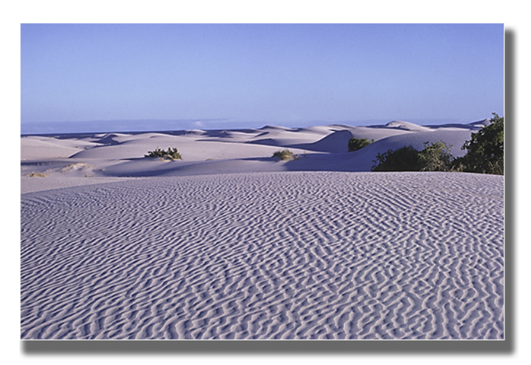
Photo 3: Coastal sand dunes at Eucla near western edge of Nullarbor.

From Adelaide I flew to Canberra to attend the International Congress, and along the way had a great view of the Snowy Mountains, which are snowy in the Australian winter, with enough snow for skiing, etc. At the airport in Canberra those of us attending the Congress were met and assigned taxis to take us to our residence in the dorms of the Australian National University (ANU). Three of us were placed in one taxi, one of us was a Barron interested in Lepidoptera. He was a rather portly English gentleman and was not used to the informal ways of the Aussie taxi drivers. As we neared the center of Canberra he asked the driver "What building is that, my man?" The driver took offence to the "my man" and when it was repeated several times I could see trouble brewing. So I came up with the thought (one of