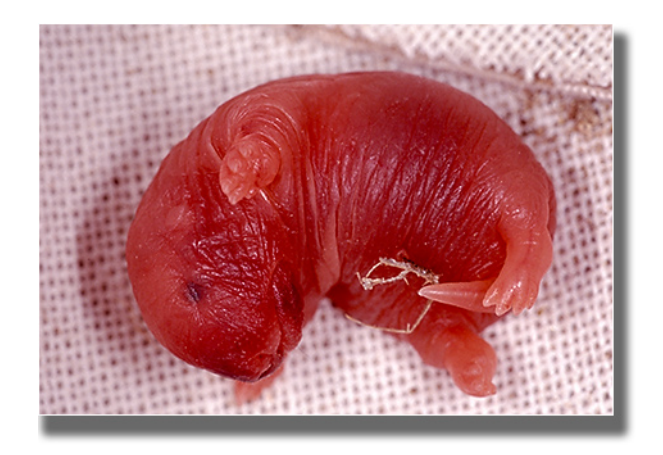
An unfortunate victim of our research.