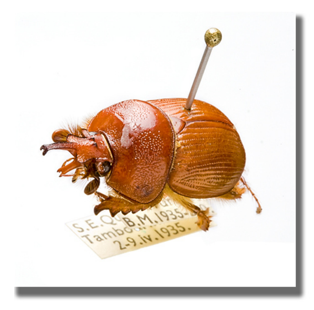
BOLBOCERATIDAE, Elephastomus proboscideus Schreibers, 1802.