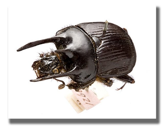
GEOTRUPIDAE, Geotrupinae, Typhoeus typhoeoides Fairmaire, 1852.