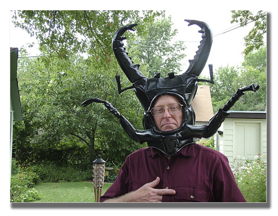
Brett Ratcliffe sent this image of what is certainly the most terrifying and dangerous horned beetle. \,