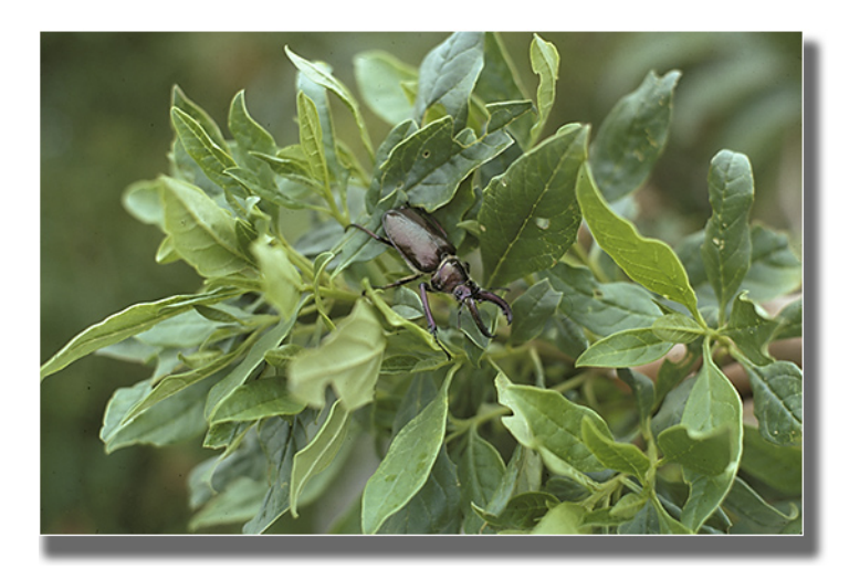
Photo 8: Sphenognathus sp. blown up to top of narrow ridge, about 8,000 feet on Sierra Nevada; one of many insects on plants at top of ridge.