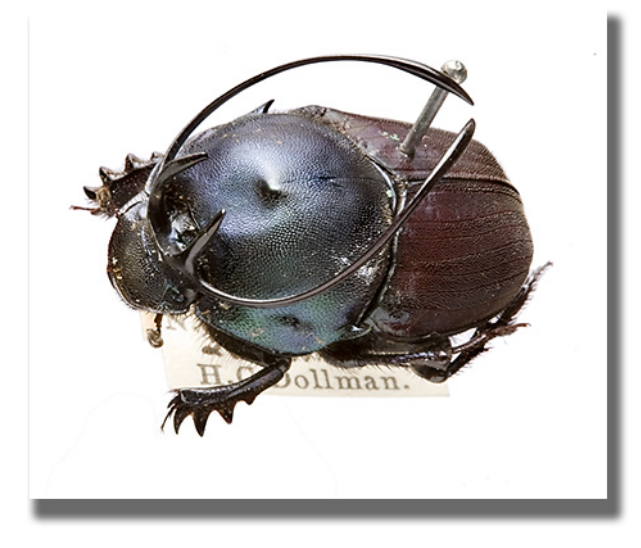
SCARABAEINAE, Onthophagini, Onthophagus ( Proagoderus ) gibbiramus d'Orbigny, 1902.

The following 11 photographs were sent in by Conrad Gillet (UNITED KINGDOM). Conrad wishes to thank Harry Taylor of the Natural History Museum Photographic Unit for the fine photographs.