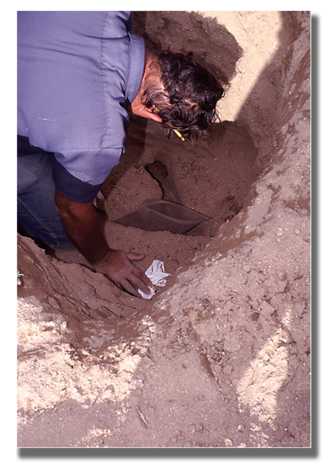
While digging down to the nesting chamber, it is a good idea to stuff a plastic trash bag into the tunnel, as cave ins are unavoidable.