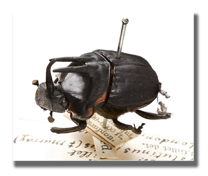
SCARABAEINAE, Phanaeini, Sulcophanaeus velutinus (Murray, 1856).