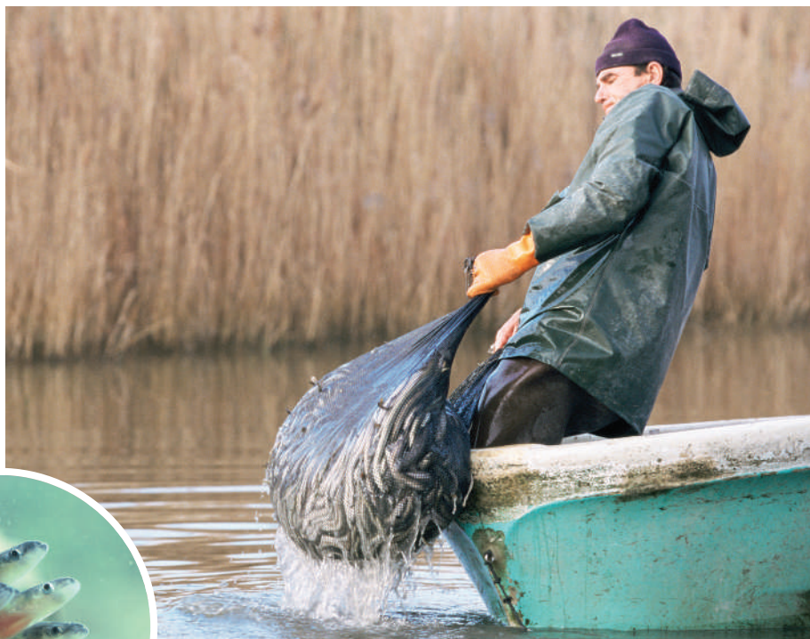
The European eel may suffer further heavy decline if CITES delays its listing.

old-fashioned command-and-control convention 5 , in contrast with current trends towards market-based and incentive-driven conservation 6 . Critics of CITES argue that it has sometimes failed to effectively regulate trade and to enforce bans 5 .