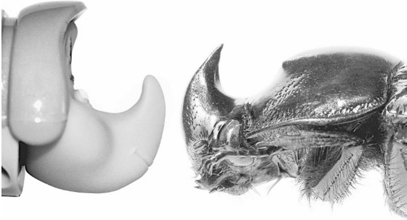
Fig. 11. Lateral view of head of Dim and M. saltini showing similarity in horn configuration ("the Dim Effect"). Dim character © Disney Enterprises, Inc. and Pixar. Used by permission from Disney Enterprises, Inc.

Pygidium : Surface weakly aciculate, minutely alutaceous. Base with transverse row of large, moderately dense, setigerous punctures; setae long, reddish brown. In lateral view, surface strongly convex in basal fourth, nearly flat elsewhere (Fig. 5). Legs : Protibia tridentate, teeth subequally spaced. Meso- and metatibia each with 2 transversely oblique carinae. Metatibia at apex with large, narrowly rounded lobe. Venter : Prosternal process long, subconical. Pro-, meso-, and metasternum with long, reddish brown setae. Metasternum either side of middle nearly completely punctate; punctures dense, small; metasternum at center impunctate. Parameres : Figs. 7–8.