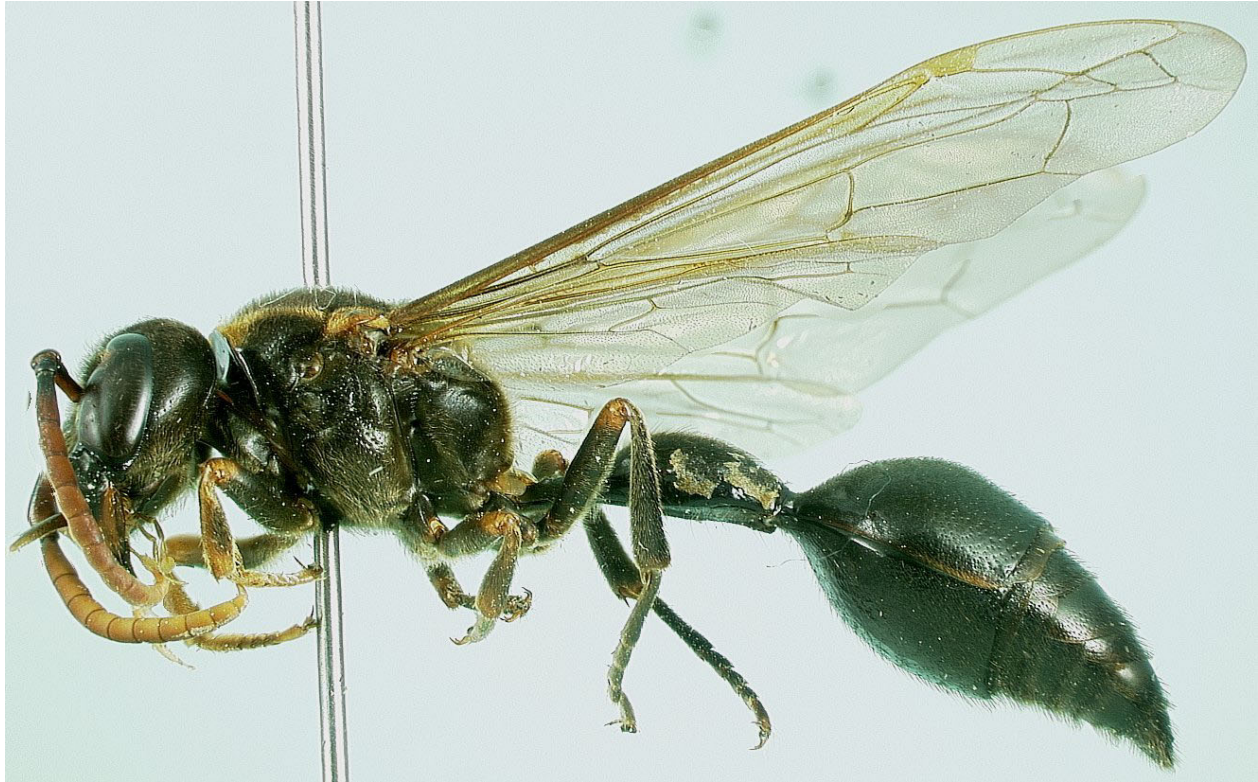
Figure 1. Zethus stangei , male holotype, lateral view of entire insect showing habitus. Note that the stem is very short.