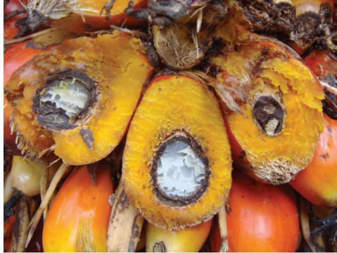
Rich pickings: crude palm oil is extracted from the yellow parts of oil palm fruit.

Private reserves are flexible and substantial complements to traditional government-funded conservation initiatives, and have been shown