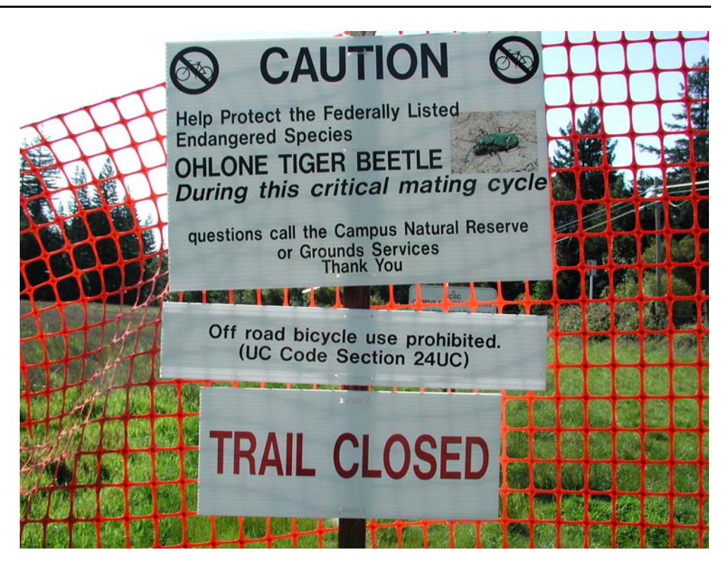
Fig. 2 Controlled area in Santa Cruz Co., California, to protect the officially endangered Ohlone Tiger Beetle ( Cicindela ohlone )

chances for comparisons, and greater competition for research subjects among the increasing number of experts, tiger beetle systematists ventured into more sophisticated areas of research. Field naturalists such as A.R. Wallace and H. W. Bates often collected tiger beetles wherever they traveled. Emergent but significant ideas about behavior, ecology and evolution also grew from their experiences of collecting and observing these beetles. The German medical doctor, Walther Horn, became the greatest authority and acknowledged specialist of the tiger beetle family, working almost solitarily for more than 50 years. Although predominantly taxonomic in nature, his articles began, later in the 1900s, to incorporate experimentally testable ideas of habitat, biogeography and intraspecific variation (subspecies).