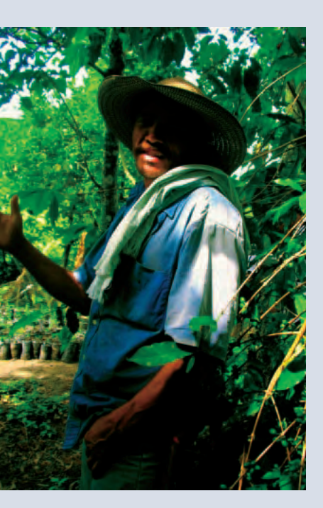
FIGURE 3 A farmer in Colombia's Quindío region with the seedlings he is about to plant on his farm.

ly to be site-specific. As with biodiversity benefits, these benefits will generally not be included in land users' decision-making.