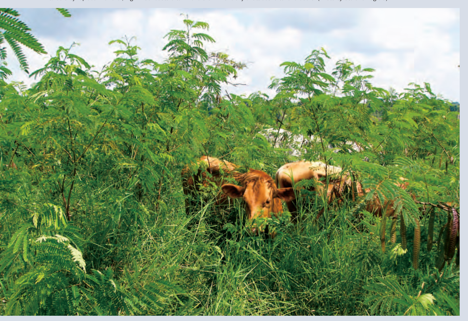
FIGURE 5 Silvopastoral practices introduce a variety of tree species in pasture. Here, cattle graze in an intensive leucaena or leadtree (Leucaena leucocephala) system in Quindío, Colombia. Such systems can be more productive and can harbor much higher levels of biodiversity than the extensive pastures they replace. However, high initial costs often make them financially unattractive to land users.

diversity than current monocultural, treeless pastures. Figure 6 shows initial data from biodiversity monitoring at the Costa Rica and Nicaragua sites. These results show that land used under a silvopastoral system harbors higher levels of biodiversity than treeless pastures. The observed diversity of bird species, as well as the number of individuals (not shown in Figure 6), is greater on land with trees, and higher yet when the tree density is higher. Similar results are being obtained for other indicators (vegetation, ants, and butterflies).