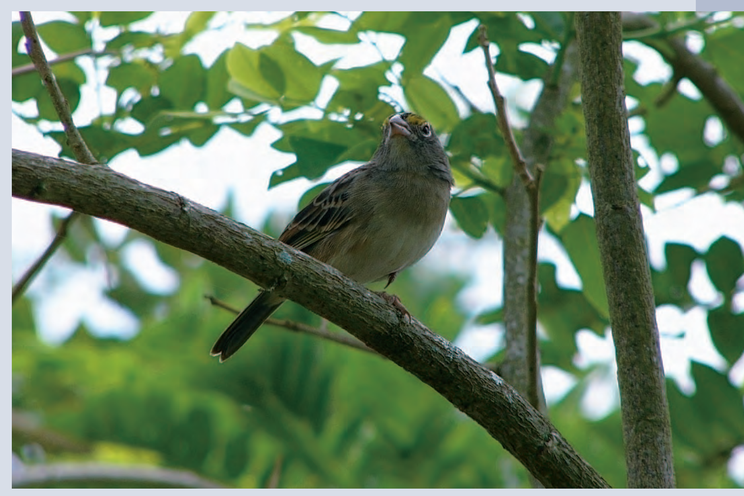
FIGURE 2 Coal miners have their canary, and the Silvopastoral Project has the sabanero grillo (Ammodramus savannarum). This critically endangered species was observed in a live fence planted under the Project in Quindío, Colombia.