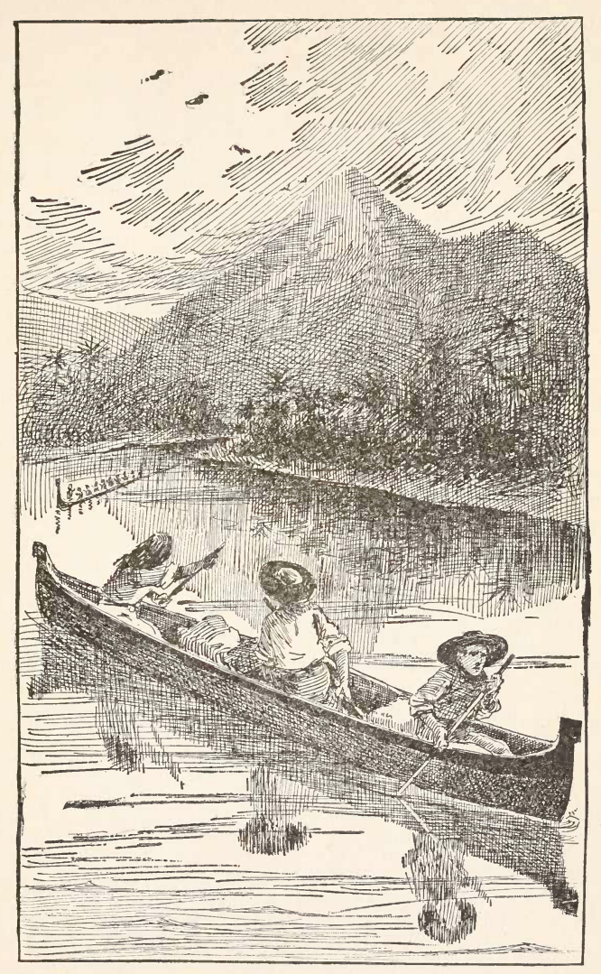
Nearer and nearer came the big canoe. The Indians were overhauling their intended prey rapidly.—(See page 207.) Digitized by Microsoft ®