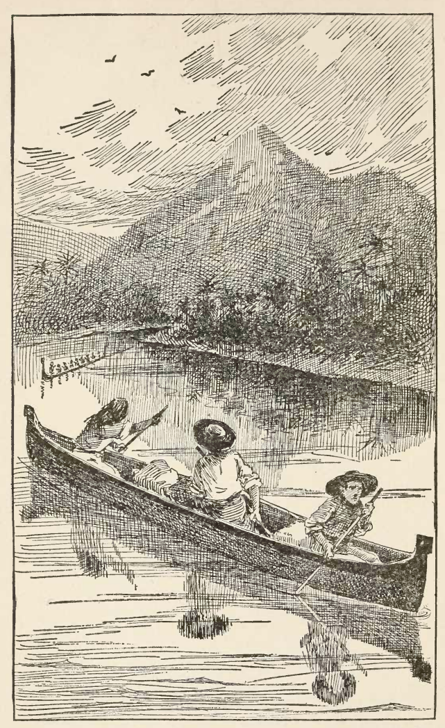
Nearer and nearer came the big canoe. The Indians were overhauling their intended prey rapidly.—(See page 207.)