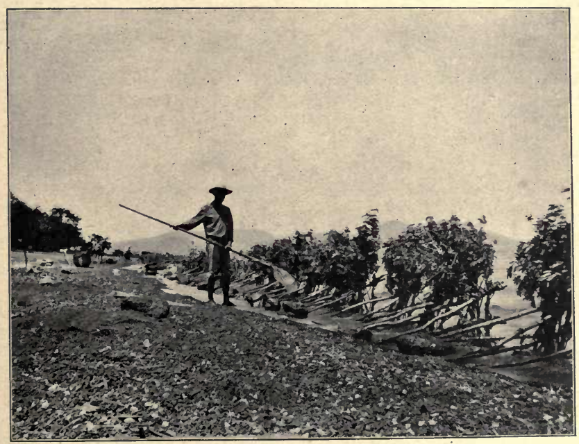
FISHING FOR SARDINAS.

March, evidently depositing its eggs, when possible, in shady places in shallow water. The natives capture these by placing small bushes along the shore about three feet apart in shallow water. These fishes come in large numbers into the shade of these bushes to deposit their eggs. The natives draw their hand nets around the bases of these bushes, catching from a few to a quart of these fishes at each dip. The fishes are thrown into holes scooped in the sand. They are then spread on the sand and left there until dry, after which they are ready for market. They are also eaten fresh as "white bait," and are very palatable.