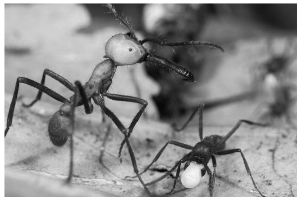
Figure 1. Extreme worker polymorphism of the army ant E. burchellii . Here, a major with ivory-coloured head and sabre-shaped mandibles guards a raiding column in which smaller workers carry prey items.

Eciton burchellii , an army ant of New World tropical forests, shows an extreme worker polymorphism with four recognized physical worker castes (Franks 1985; figure 1). Moreover, E. burchellii queens typically mate with 10–20 males, resulting in a large number of worker patrilines (full-sib families with the same mother and father) in each colony (Kronauer et al. 2006). Taking advantage of this combination of social traits, we show that genes have a significant effect on worker caste determination.