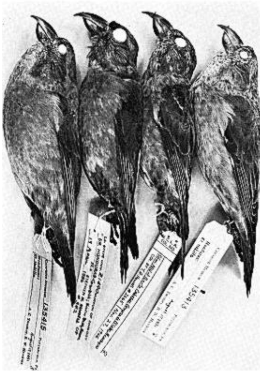
FIGURE 2. Red Crossbills from montane Central America and the Caribbean pinelands, showing relative bill sizes. The bills of the specimens shown are within 0.2 mm of the mean culmen-from-nostril length for each sex in each population. Left to right: male, montane Honduras; male, British Honduras; female, Nicaraguan pine savanna; female, montane Honduras.

to be generally larger (fig. 2), but these birds deal entirely with the small cones of Pinus caribaea and their bills may be less subject to stress and wear at the tip than those of montane birds that deal with the larger cones of Pinus oocarpa . The crossbills of British Honduras and the Mosquitia may be distinct from mesamericana , but the sample size is too small as yet to justify nomenclatural recognition.