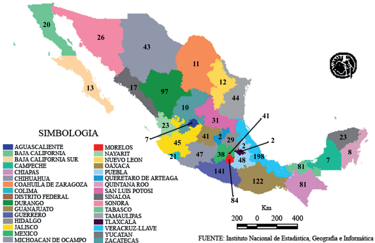
Map 1. Mexican Alticinae diversity per State