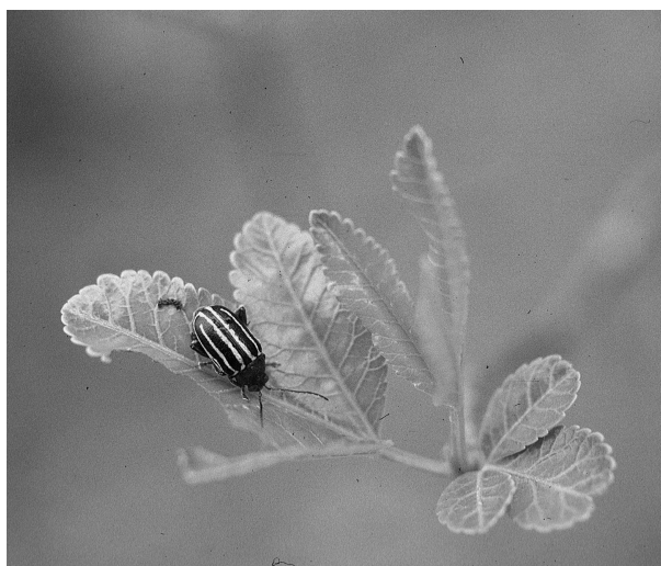
Fig. 3. Blepharida lineata Furth on Bursera trimera Bullock, Guerrero, June 1993. (Photo: D. Furth).