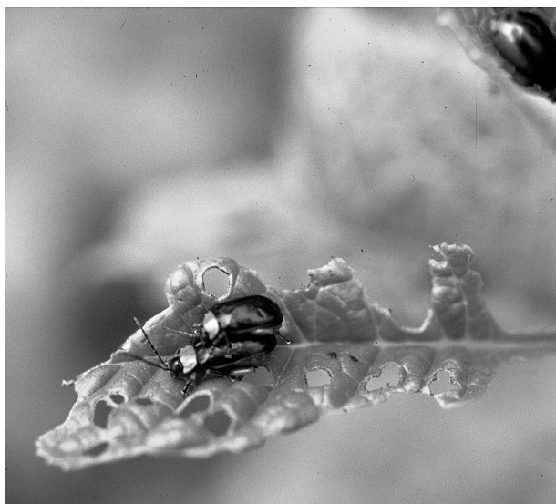
Fig. 1. Asphaera abdominalis (Chevrolat) on Ludwigia peploides (Kunth) Raven, in copula, Zacatecas, July 1995.

Nearctic Alticinae (ca. 40 genera) are reasonably well known at the genus and species level in comparison to the Neotropical taxa (over 200 genera); however, there are certainly many more new species to be discovered there. Recently there was an update of the treatment at the genus level (RILEY et al. 2002) including keys. RILEY et al. (2003) have published a detailed checklist to the Nearctic Chrysomelidae. Neotropical Alticinae have been recently treated in a number of references by J. and B. BECHYNÉ (see References), D. BLAKE (see References), WILCOX (1975), SCHERER (1983), FURTH & SAVINI (1996, 1998), FURTH et al. (2003), and FURTH (2004). Almost half of the known Alticinae genera occur in the Neotropics; about 230 generic names were listed in SCHERER (1983) about 90 of which were described by Jan and Bohumila Bechyné.