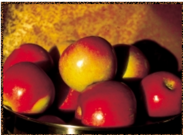
Unblemished organic apples can be grown when growers employ rigorous pest management practices.

Organic apple production represents one of the most intensively managed organic systems.