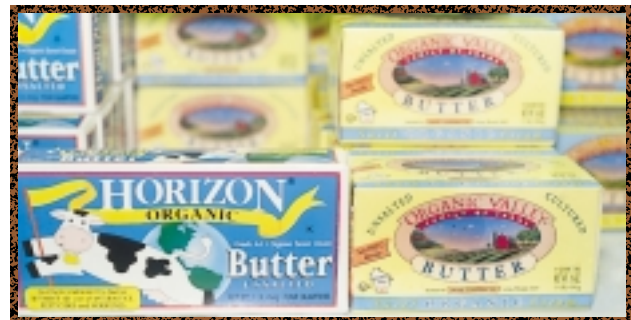
Products labeled as “organic” meet strict legal requirements, including certification by a third party.

Though the term “organic” is defined by law (see “Legal” section on pages 3 and 4), the terms “natural” and “eco-friendly” are not. Labels that contain those terms may imply some organic methods were used in the production of the foodstuff but do not guarantee complete adherence to organic practices as defined by a law. Some products marketed as “natural” may have been produced with synthetic or manufactured products (those not considered to be “organic”), such as “natural beef.” While eco-labels are encouraged for producers interested in lowering synthetic inputs and farming with ecological principles in mind (biodiversity, soil quality, biological pest control), eco-labels are not regulated as strictly as USDA organic labels.