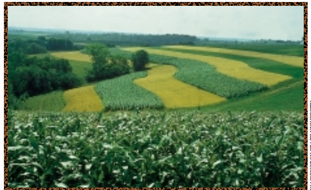
WASHINGTON STATE UNIVERSITY

The U.S. organic industry continues to grow at a rate of 20 percent annually. Industry estimates placed it at $10 billion in 2001. The organic industry is a consumer-driven market. According to industry surveys, the largest purchasers of organic products are young people and college-educated consumers. Today we are faced with the unique opportunity to take advantage of a growing market demand and use the technologies developed over the past 50 years. More and more farmers are interested in the profitability and environmental benefits that organic systems yield.