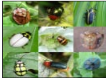
Some chrysomelid found in the park.