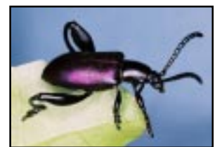
Fig. 5. Sagra ( Tinosagra ) bicolor.

With jewels like this Sagra ( Tinosagra ) bicolor Lacordaire (Fig. 5) collected at