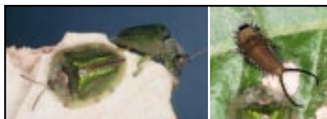
Figs. 2-3. Basipta stolidus (adults left, larva right).