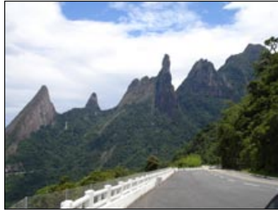
Serra dos Órgãos National Park