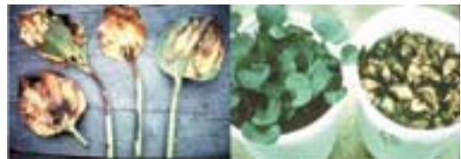
Figure 5. Blighting symptoms caused by Rhizoctonia solani on leaves (left) and whole plants (right). Picture on the right shows fungus-infected and uninfected control plants