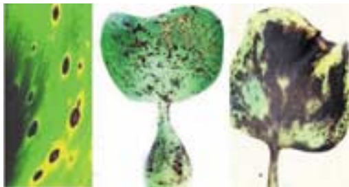
Figure 2. Discrete necrotic leaf spots surrounded by yellow halo (left), symptoms developed when inoculated with spores (middle) or mycelium and kept under high humidity (right)