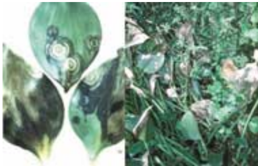
Figure 1. Zonate leaf spots caused by Acremonium zonatum (left) and naturally infected plants in the field (right)