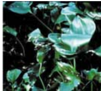
Figure 4. Teardrop-shaped foliar lesions and the extent of damage caused by Myrothecium roridum