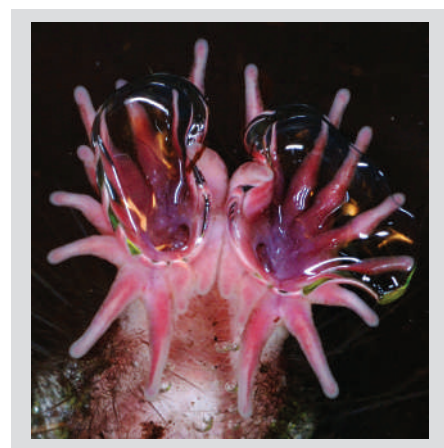
Figure 1 | Star nose of the mole ( Condylura cristata ) breathing air while underwater. Bubbles are of comparable size to 'sniff' volumes above water in small mammals.

The five moles tested on an earthworm scent followed the underwater scent trails to reach a reward with an average accuracy of 85% (ranging from 75% to 100% correct for the 20 trials used for each mole; Fig. 2a), and the two moles tested on a fish scent followed the smell with 85% and 100% accuracy, respectively (see supplementary information).