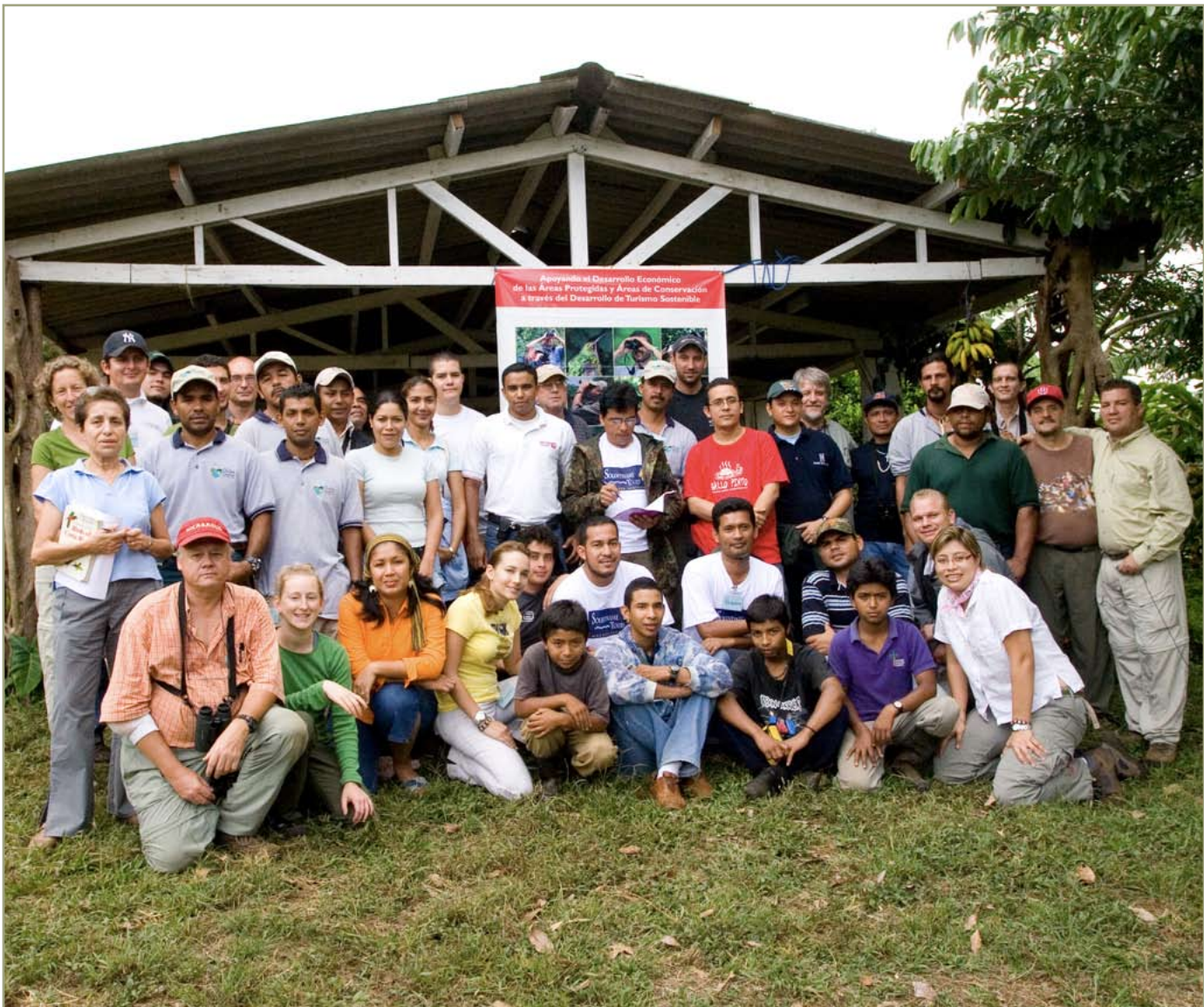
Group photo of course participants and instructors.