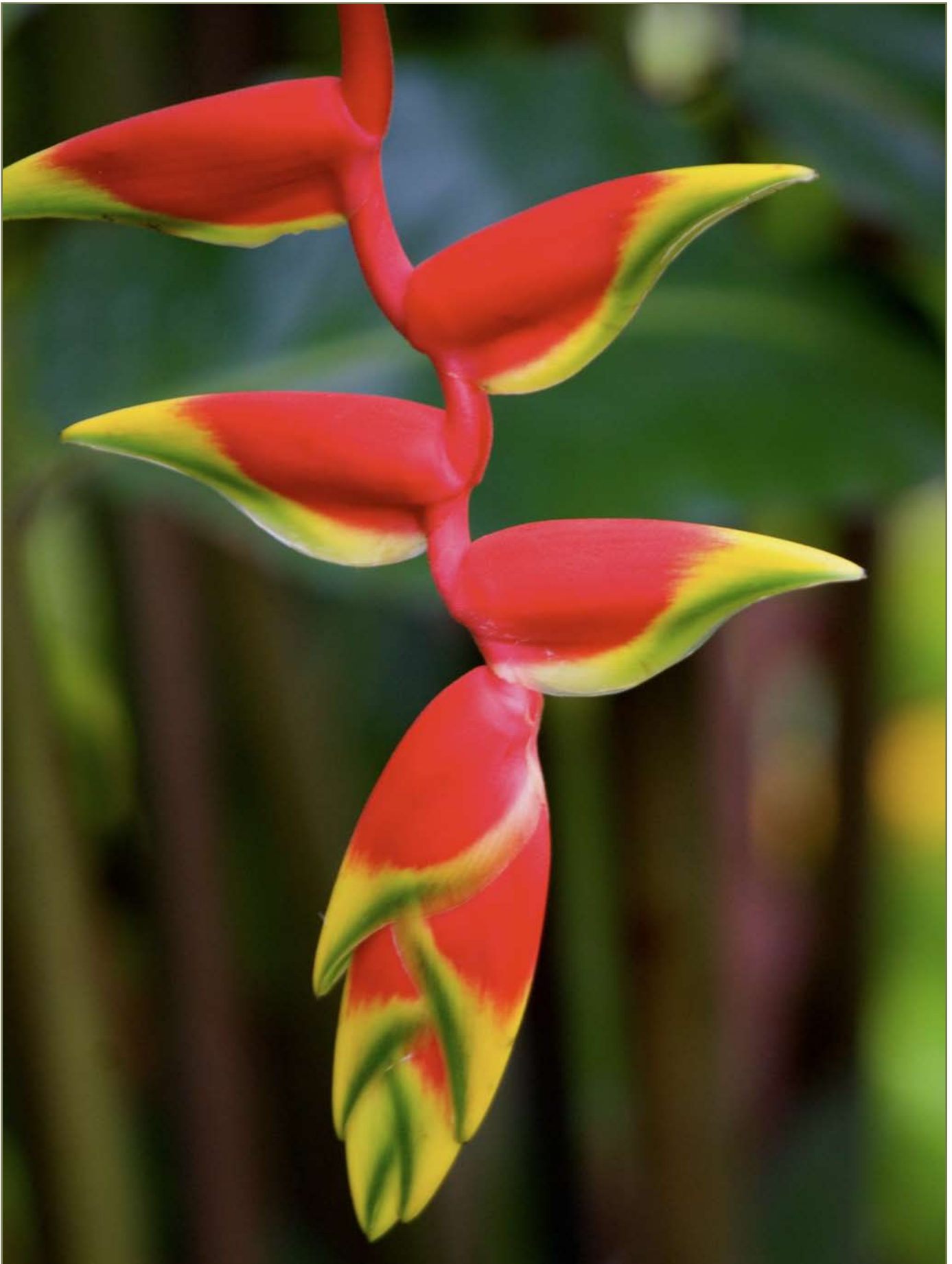
Heliconia (Lobster Claw) flower, bright colors such as this attract birds.