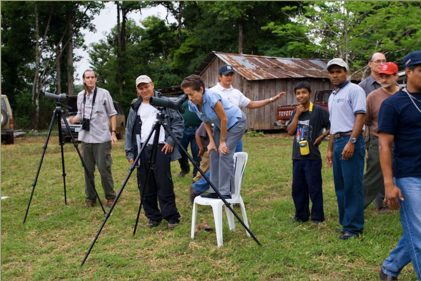
Course participants during field activities.