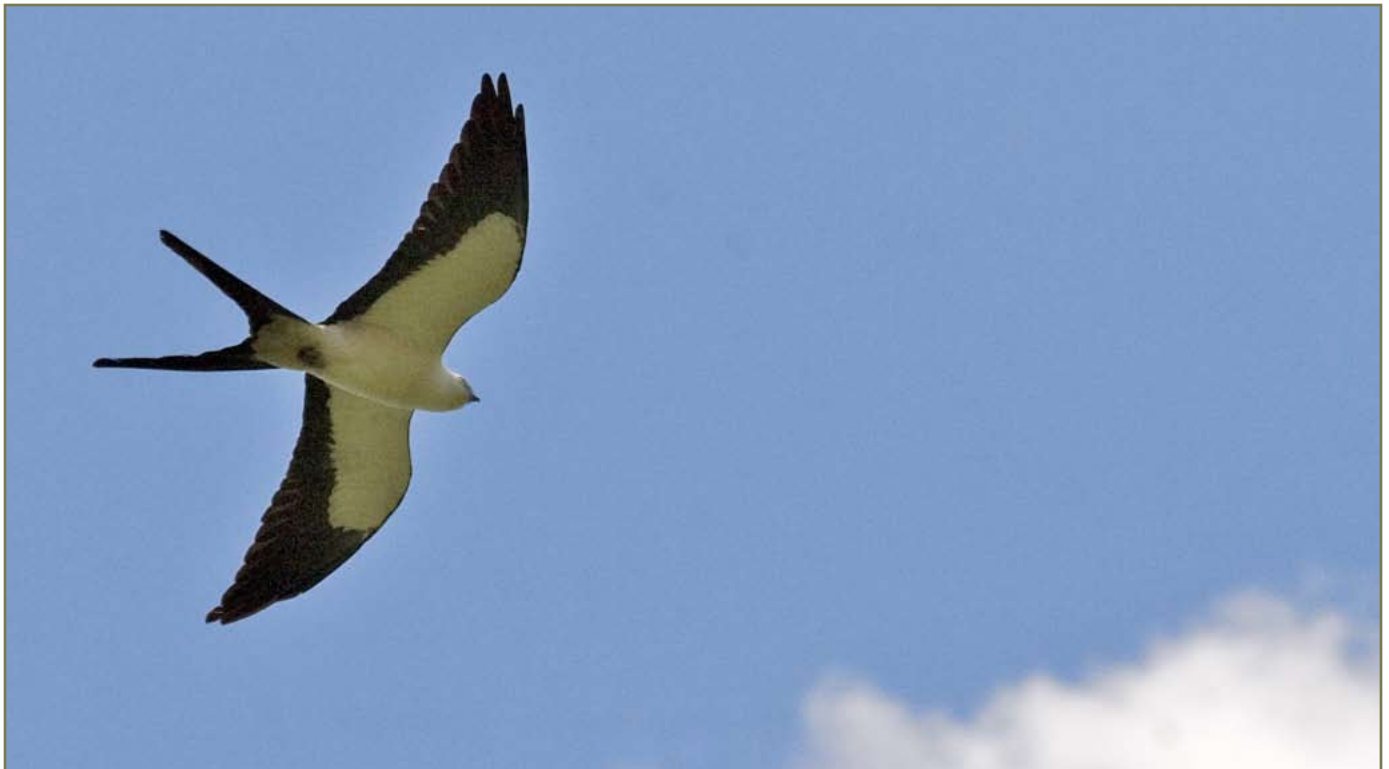
American Swallow-tailed Kite, a South-American migrant to El Jaguar Private Reserve.

Appendix 5: Invitation & Promotional Banner