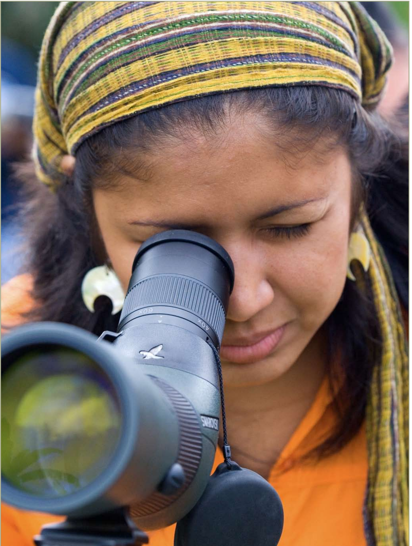
Course participant observing birds using spotting scope.